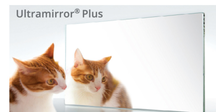
UltraMirror® Plus on clear (Clear substrate)