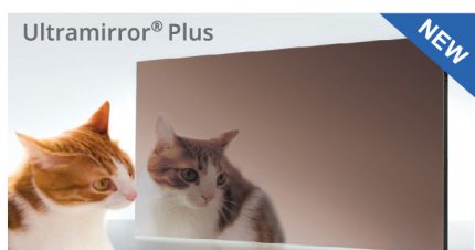
UltraMirror® Plus on Euro Bronze (Tinted bronze substrate)