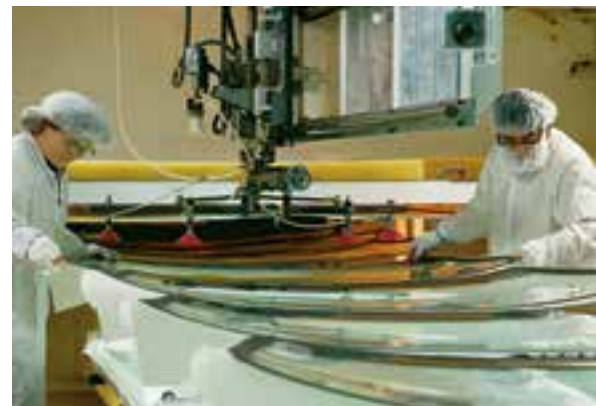
Guardian glass protects passengers while reducing solar load for a cooler cabin, better fuel economy and fewer vehicle emissions while offering options that add statement-making style.

Call 800.521.9040, email AutoFloatGlass@Guardian.com or visit Guardian.com to learn more.