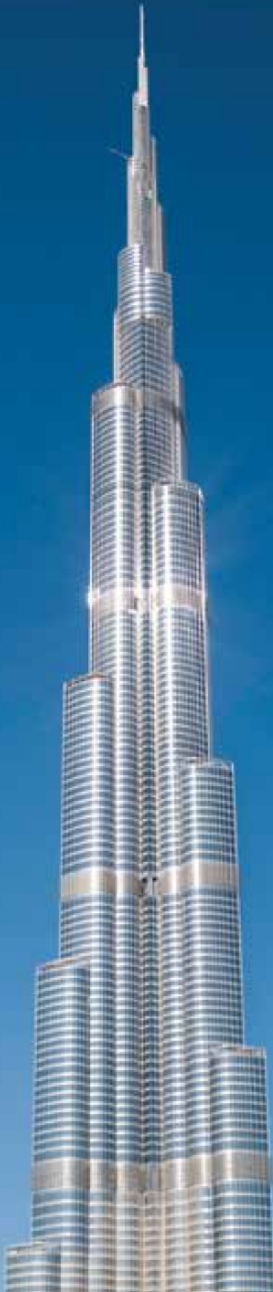
Guardian glass adorns extraordinary buildings, including the world's tallest, Burj Khalifa in the UAE. The building features SunGuard Silver 20.