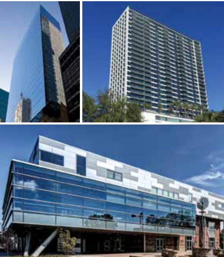
Top left: SunGuard AG 43 permits spectacular views from the Aman Tower in New York City.

SunGuard® Advanced Architectural Glass from Guardian helps architects create striking building designs using natural light and color—while significantly reducing energy costs. SunGuard low-emissivity and solar control coated glass is specifically designed for a wide variety of commercial applications, including office buildings, high-rise apartments, schools, hospitals, libraries, government buildings, arenas and more. We can help architects and designers with glass solutions that meet local performance needs and realize their vision.