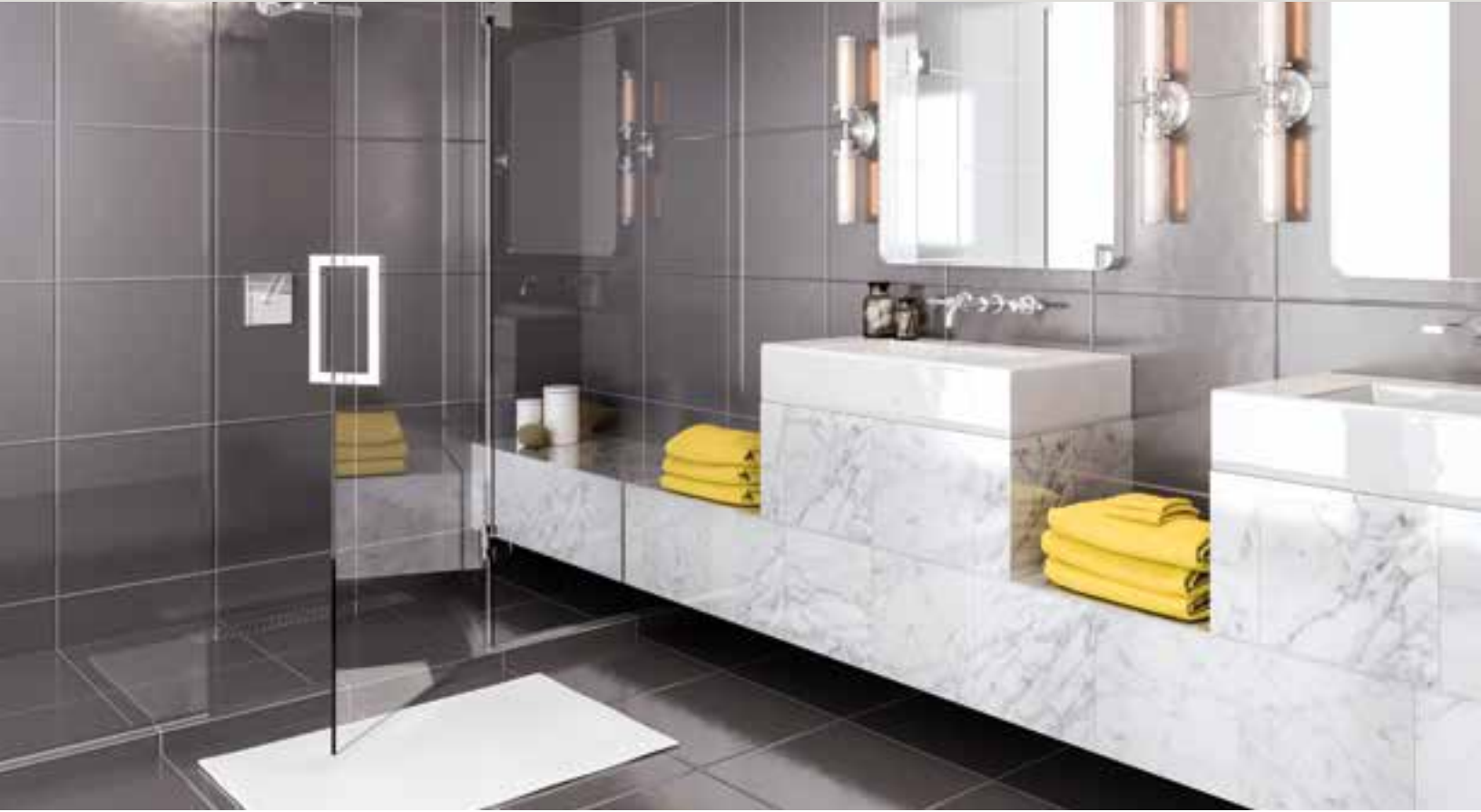
ShowerGuard Glass is permanently sealed to keep it looking forever beautiful.