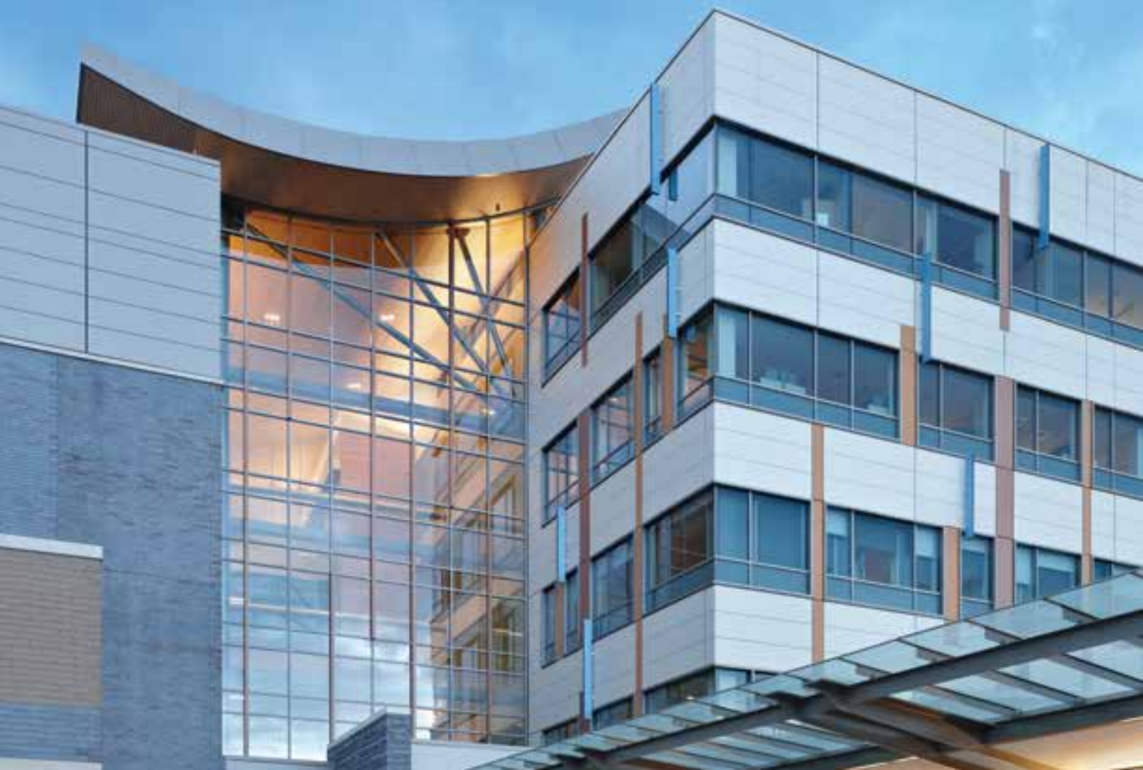
SunGuard SuperNeutral 68, SuperNeutral 54 and AG 50 helped create the impressive Swedish Hospital, Issaquah, Washington.